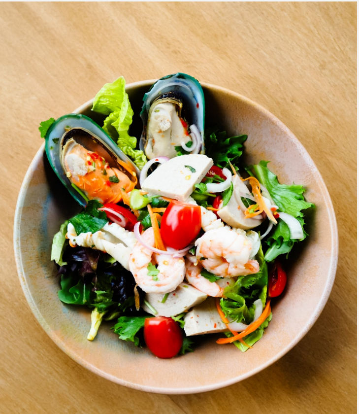
SEAFOOD AND MOO YOR SALAD